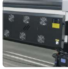
External Infrared Heating Fan