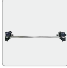
Dual power take up system