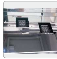
All Aluminium Alloy Carriage Station