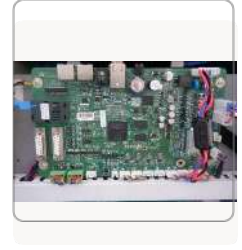
High Performance Control System