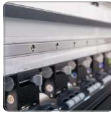
THK Mute Guide Rail