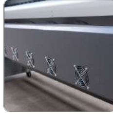
Infrared air- drying System