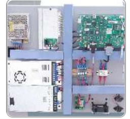
High Performance Control System