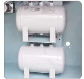
With Negative Pressure