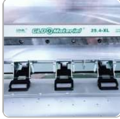
Taiwan Hiwin Mute Guider Rail