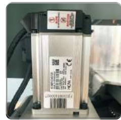
HCFA Servo Motor