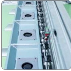
Segmented Air Suction Control