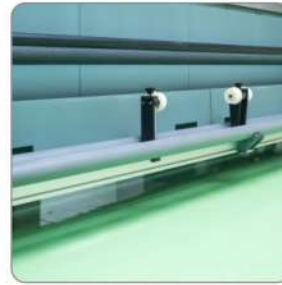
Double Feeding System