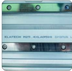
Taiwan Hiwin Double Mute Guider Rail