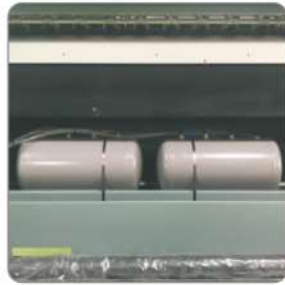
25L Double Negative Pressure