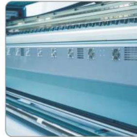
Infrared air- drying System