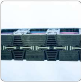
IGUS Tank Chain