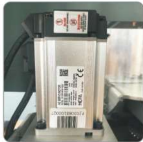
Imported Servo Motor