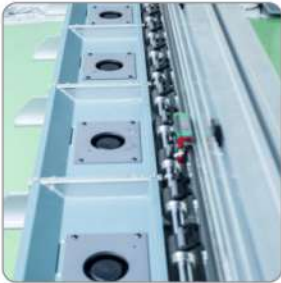
Segmented Air Suction Control