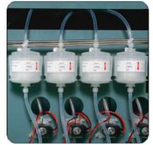
Imported Large Capacity Filters