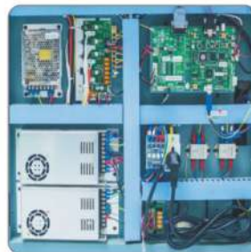
High Performance Control System